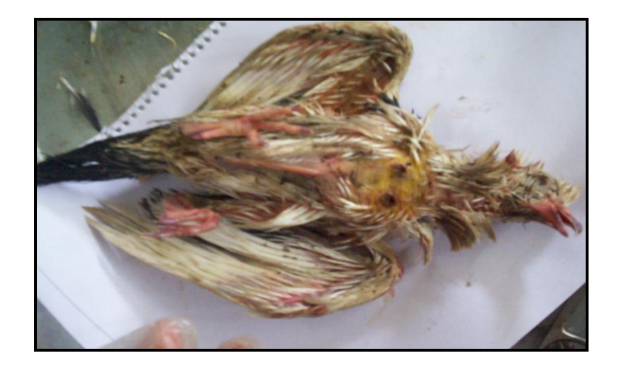
Figure 11: A Case of Snake Bite in the Breast Region