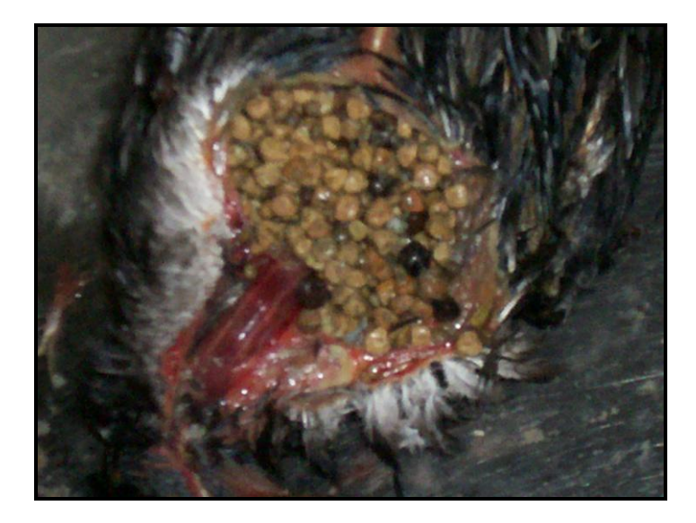
Figure 8: Crop Content (Gram & Stone) of a Dead Pigeon