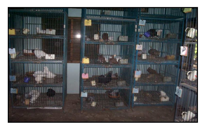
Figure 13: A Cage Reared Farming of Pigeon

Cervical dislocation and haemorrhage, morbus cordis and external injury were found in the postmortem. It indicates that cannibalism and mishandling of pigeons is one of the major causes for pigeon mortality.