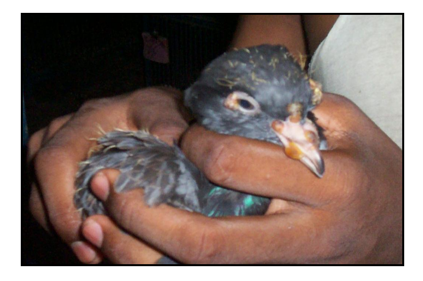
Figure 12: A Case of Pigeon Pox in a Farm of Chittagong