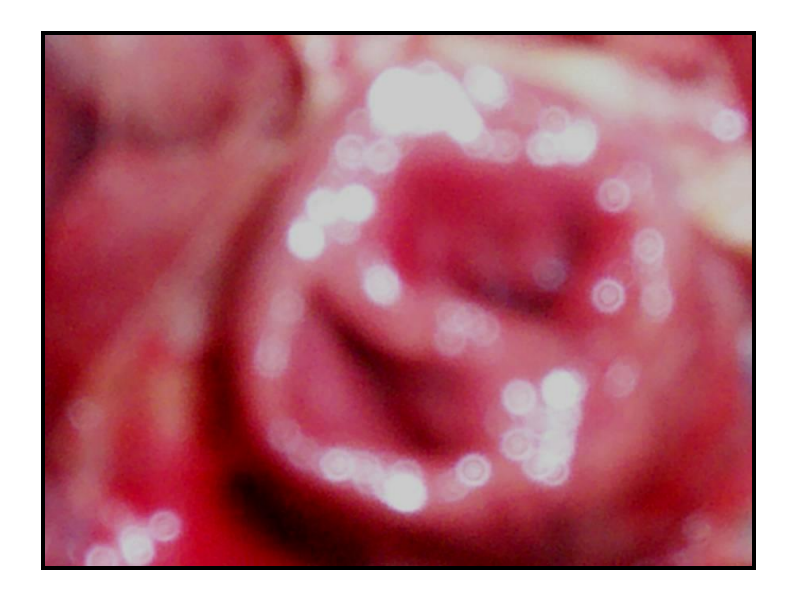
Figure 3: A Case of Morbus Cordis in a Dead Pigeon Showing Dilatation of the Heart Chambers