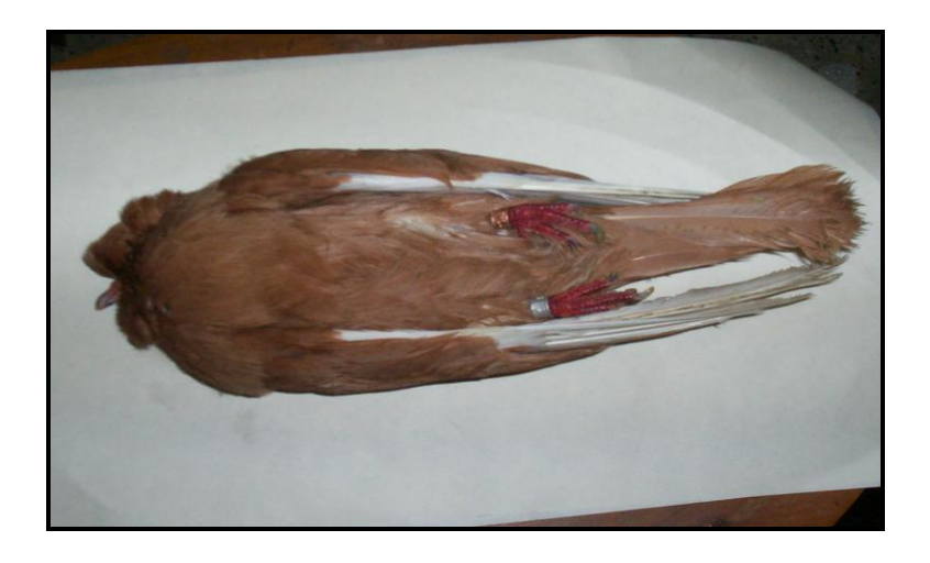
Figure 9: A Moyurponkhi Pigeon Prior to Post Mortem