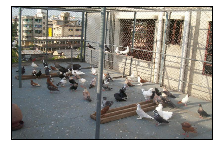
Figure 14: A Backyard Farming of Pigeon