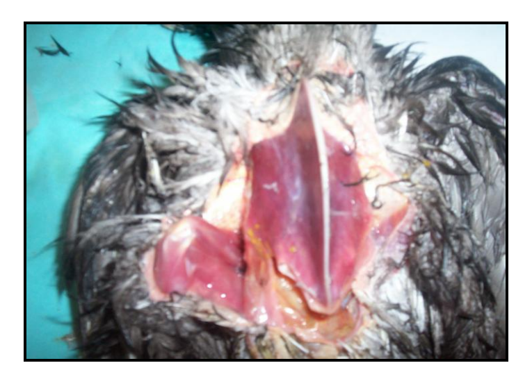
Figure 4: Cachexia of the Breast Muscle of a Dead Pigeon