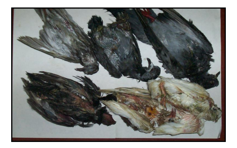
Figure 10: A Group of Squabs Arranged Prior to Post Mortem