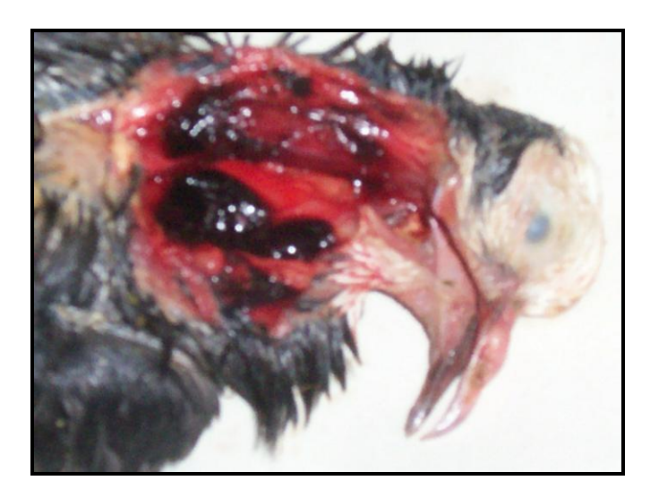
Figure 7: A Case of Cervical Dislocation in a Dead Pigeon Showing Massive Haemorrhage